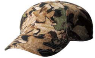
Item: MO14 Forest Floor