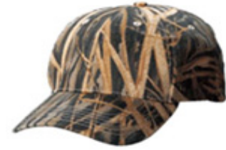
Item: MO12 Shadow Grass