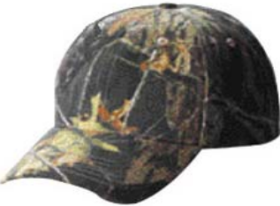
Item: MO15 Breakup

GDC300 NEWSTYLE Outdoor Cap Mothwing Camo